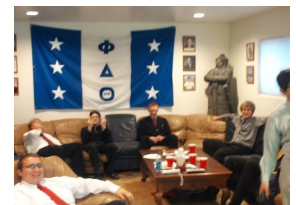
Spring Rush 2010

We feel that it is important to show Rushees what it means when we say we are a Fraternity for life, and we believe that it would be helpful in displaying true Brotherhood to the Rushees.